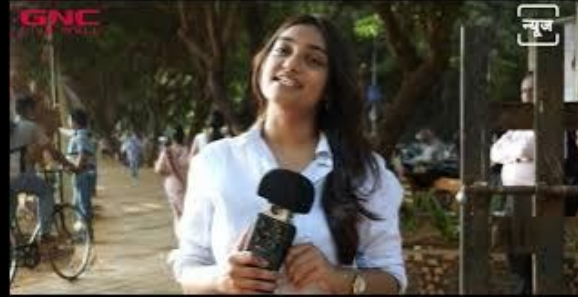
GNC TEEN PROTEIN