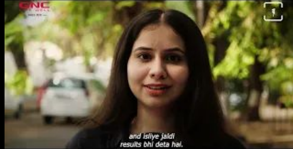
GNC FISH OIL