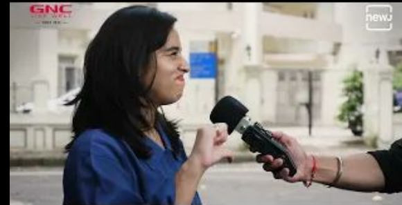
GNC IMMUNE FORMULA