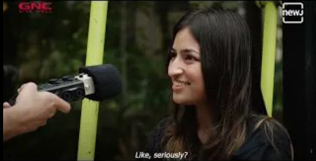
GNC POWER PROTEIN