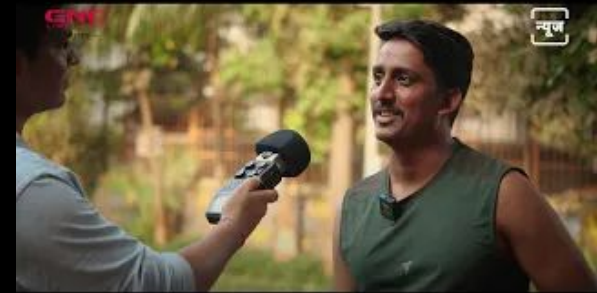
GNC Mega Men Sport Multivitamin