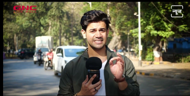
GNC IMMUNE FORMULA