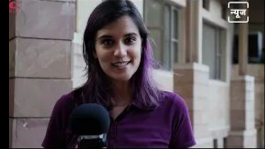
GNC PLANT ISOLATE