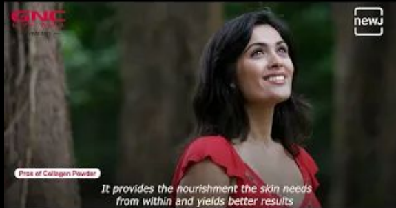
GNC Marine Collagen Powder