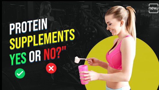
GNC Marine Collagen Powder